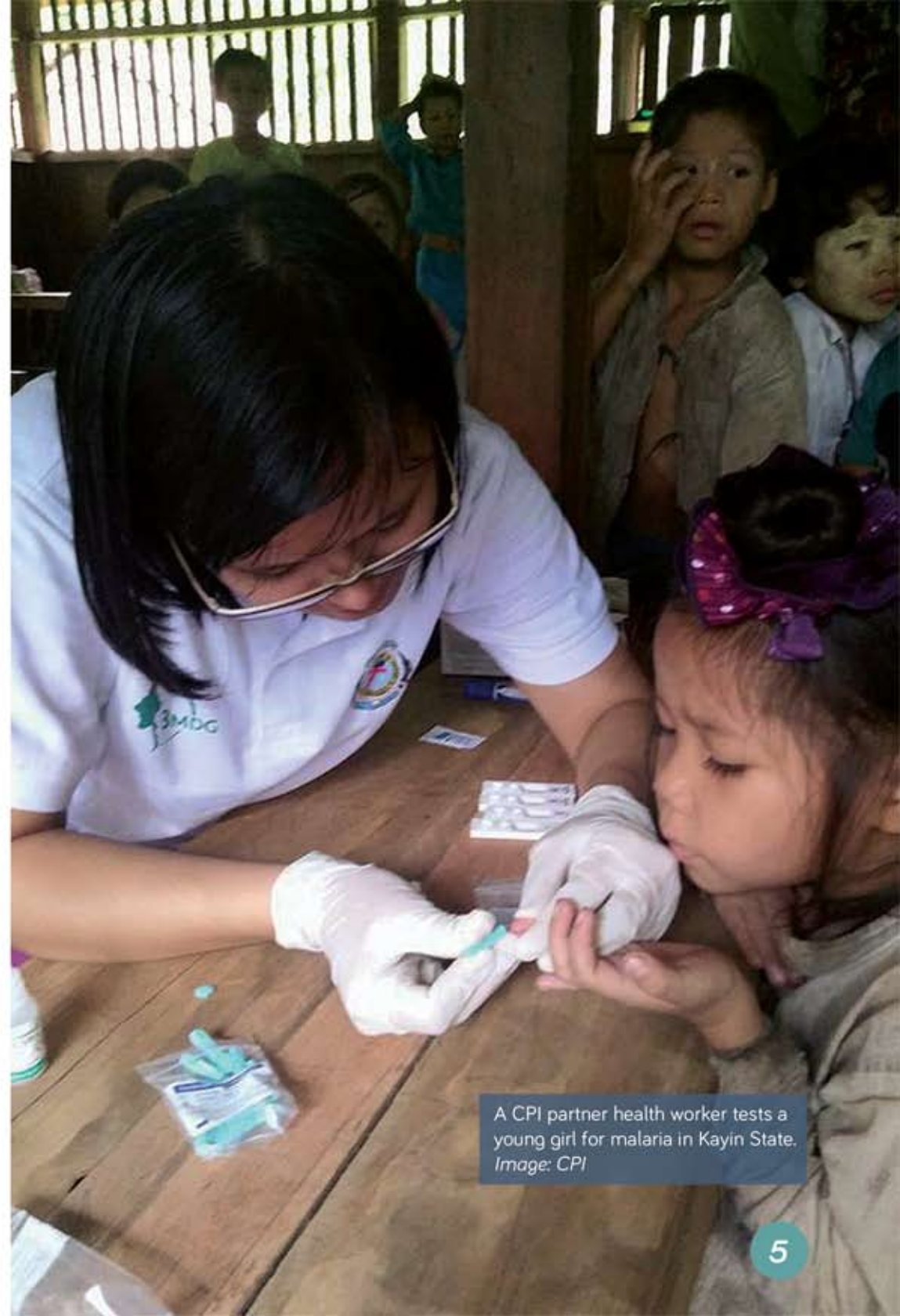
A CPI partner health worker tests a young girl for malaria in Kayin State.

As malaria rates continue to fall, we are looking to broaden the remit of village-based malaria volunteers. We have begun training them to perform basic diagnosis for other key diseases such as HIV/AIDS and Tuberculosis, and to refer suspected cases for further testing and treatment. Funding permitting, and in line with the Government of Myanmar's National Health Plan, we will continue to broaden their role to encompass other key areas of primary care including basic maternal and child health.