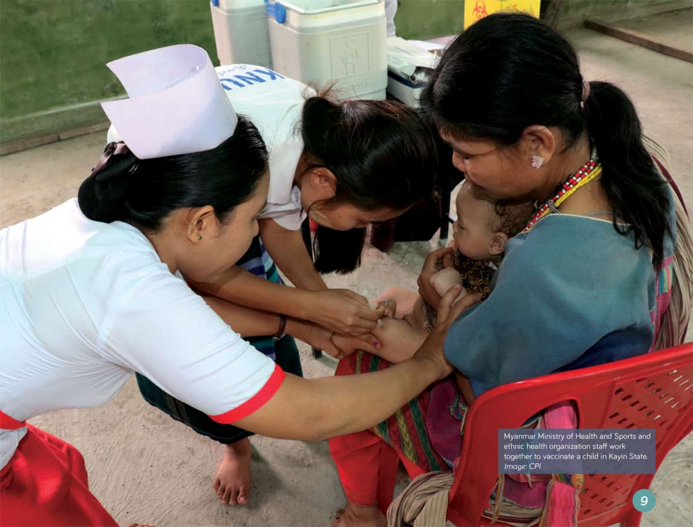
Myanmar Ministry of Health and Sports and ethnic health organization staff work together to vaccinate a child in Kayin State.