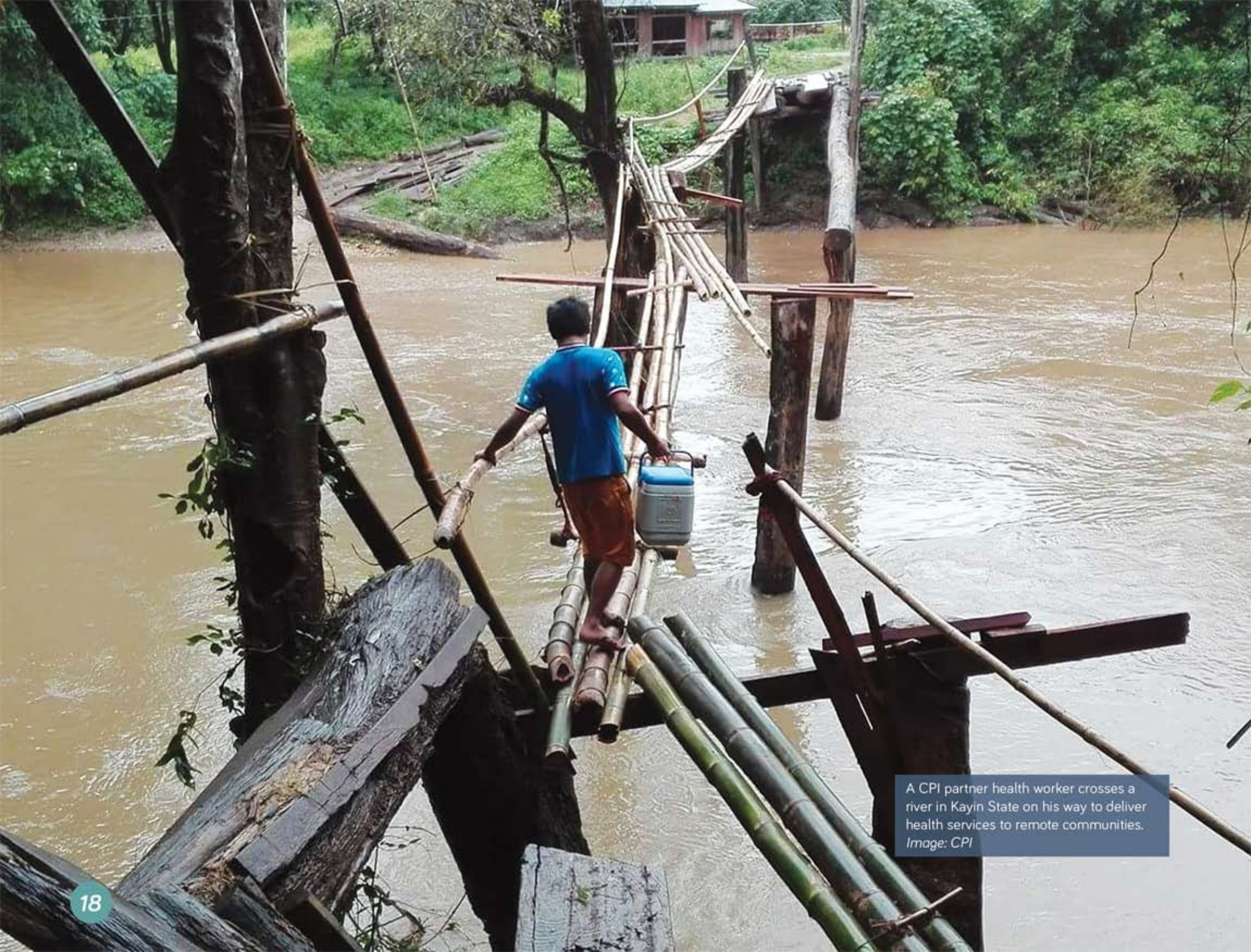
A CPI partner health worker crosses a river in Kayin State on his way to deliver health services to remote communities.