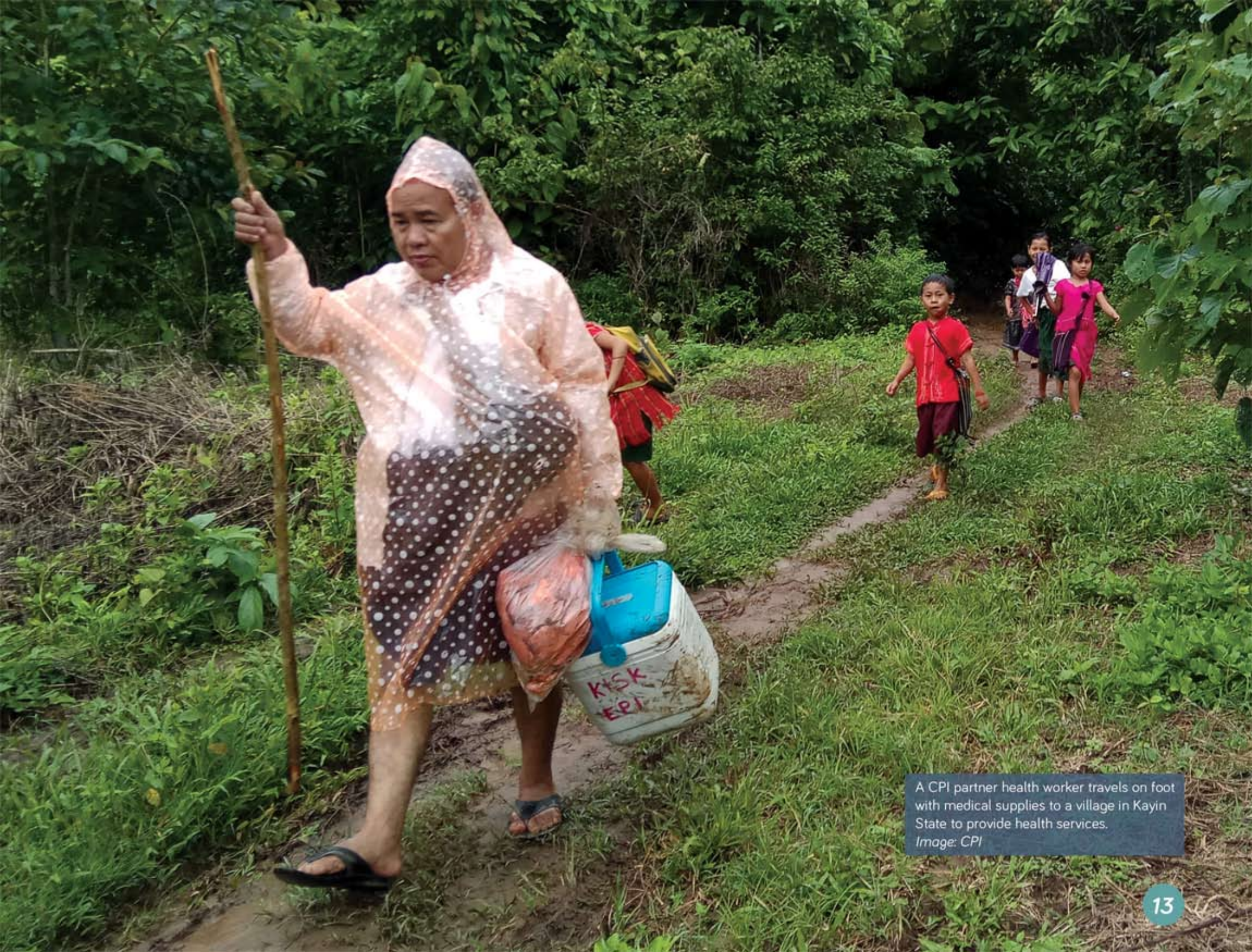
A CPI partner health worker travels on foot with medical supplies to a village in Kayin State to provide health services.